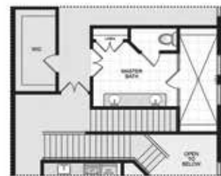
SECOND FLOOR WITH THIRD FLOOR PLAN

In the interest of continuous product improvements and to meet changing market conditions, the builder reserves the right to change or modify square footage, floorplans, elevations, specifications, plans, features, maps, prices and product types without any prior notice or obligation. Some features such as windows may change or vary from plan to plan. 9/17